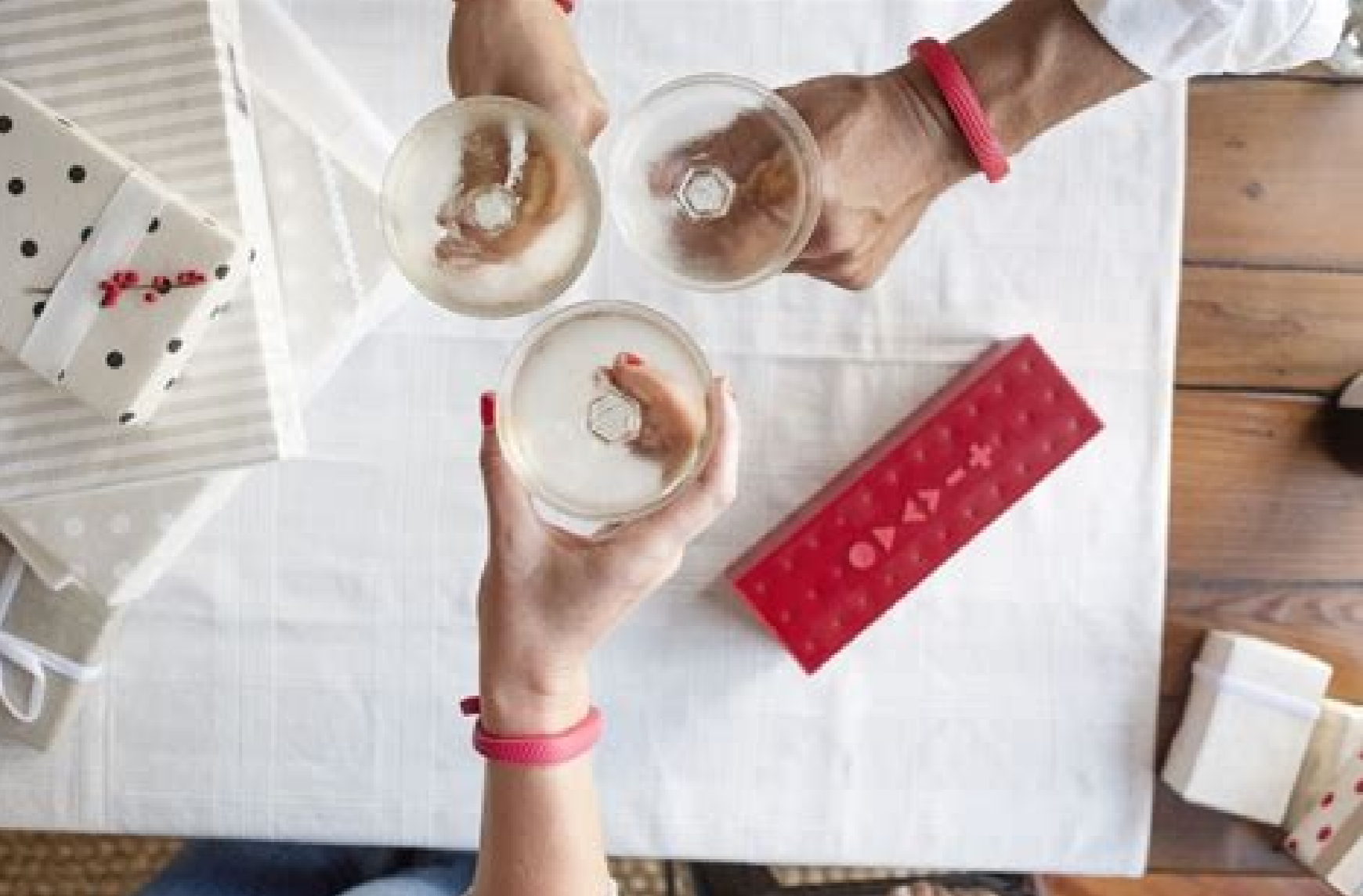
Jawbone big jambox manual. Jawbone jambox manual.